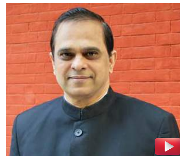
SHRI V. SRINIVAS, I.A.S. DIRECTOR GENERAL, NCGG

The National Centre for Good Governance is deeply privileged to be chosen as the institute in focus for implementing the ITEC Programs for December 2020. In July-September 2020 period, the NCGG has conducted two ITEC-NCGG workshops on "Good Governance Practices in a Pandemic" for 19 countries of Asia and 26 countries of Africa where the best practices in a pandemic – digital governance, healthcare, education, Vande Bharat Misson and redressal of public grievances were deliberated by eminent Indian and International civil servants. Over 450 delegates participated in deliberations.