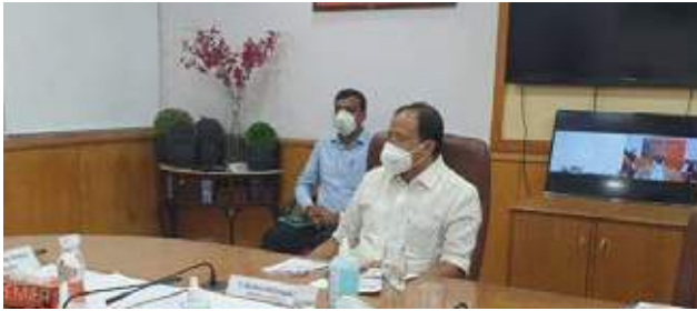
Mr. V. Muraleedharan, Minister of State for External Affairs, attended the Inaugural session of the e-ITEC program on COVID-19 Good Governance Practices in a Pandemic along with Dr. Jitender Singh, Union Minister of State (Ind Charge)

The year 2020 saw a sudden shift in the dynamics of how we perceive our world. In adherence to this 'New Normal' we witnessed the commencement of various e-ITEC programs. In order to facilitate closer engagement with the ITEC institutes and the participants, it was our honor and privilege to have such esteemed guests take part virtually in the opening and closing sessions of many of our programs.