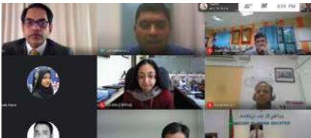
Dr Ibrahim Hassan, Minister of Higher Education, Government of Maldives enthusiastically supported e-ITEC trainings in Maldives along with Mr. Sunjay Sudhir, High Commissioner of India to Maldives and other dignitaries.