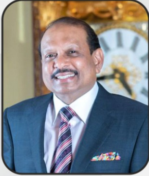
M.A. YUSUFF ALI CHAIRMAN & M.D. LULU GROUP

Mr. Yusuff Ali M.A. ranks among reputed NRI business personalities around the world today. Under his dynamic leadership, Lulu Group has achieved significant growth and diversified into various business lines. The Lulu Group with its headquarters based in Abu Dhabi is one of the leading importers, wholesalers and retailers of all kinds of consumer items with a world-wide business. He was the first and only Indian from the Middle East elected to the Director Board of Abu Dhabi Chamber consecutively for a record third time. In recognition of his remarkable achievements in Business & Industry and his distinguished services in the field of social work, he was conferred prestigious "Pravasi Bharatiya Samman Award" in the year 2005 and Padma Shri award in the year 2008.