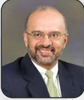
MR. PIYUSH GUPTA CEO AND DIRECTOR OF DBS GROUP

Mr. Piyush Gupta has been Chief Executive Officer and Director of DBS Group since 2009. DBS is a leading financial services group in Asia, headquartered in Singapore. Mr. Piyush is also the Vice-Chairman of the Institute of International Finance, Washington. In addition, he is a member of Singapore's Advisory Council on the Ethical Use of AI and Data, McKinsey Advisory Council, and the Bretton Woods Committee - Advisory Council. Mr. Piyush is a term trustee of the Singapore Indian Development Association (SINDA). Piyush was named one of the world's top 100 best-performing chief executives in Harvard Business Review - 2019 edition of "The CEO 100". In 2020, he was awarded the Public Service Star by the President of Singapore for his meritorious services to the nation.