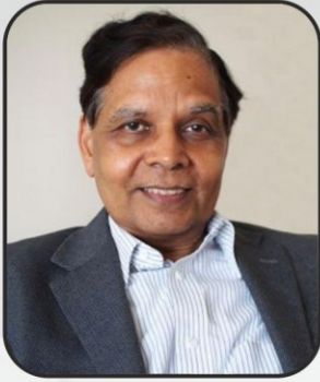
PROF. ARVIND PANAGARIYA

PROFESSOR OF ECONOMICS, UNIVERSITY OF COLOMBIA, USA